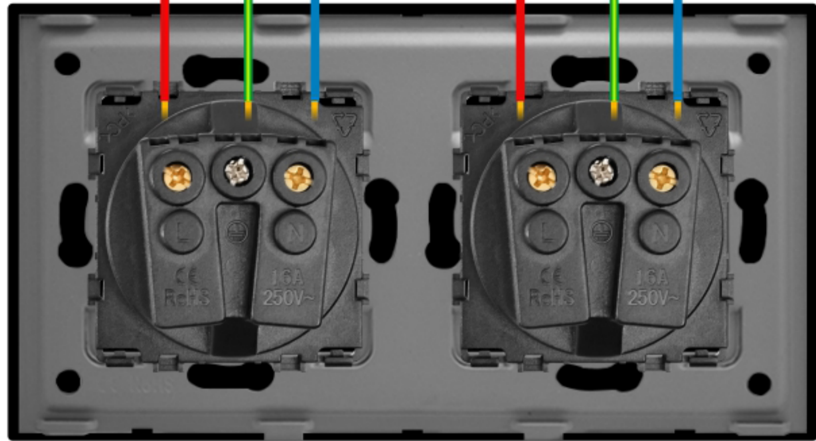
Diagrama de instalare